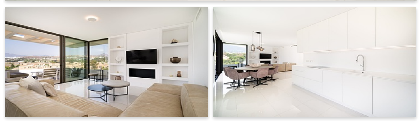
Exceptional modern 3 bed duplex penthouse apartment in Atalaya – Estepona